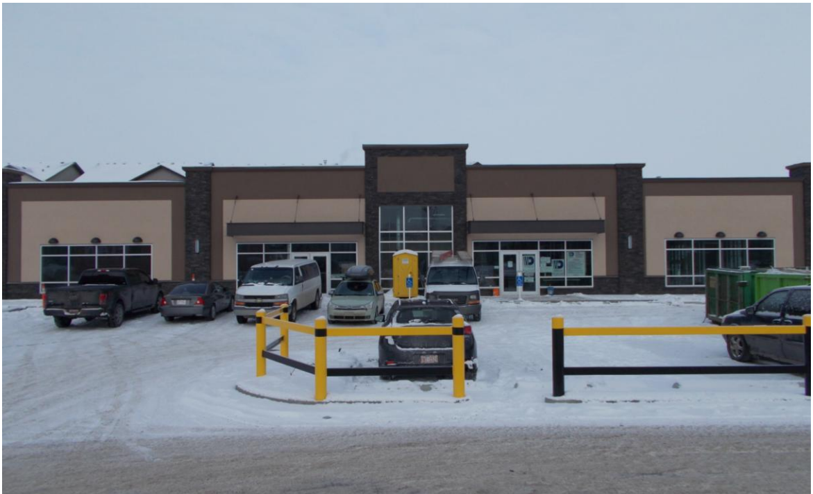
Panorama Calgary Co-op Commercial Building, Calgary