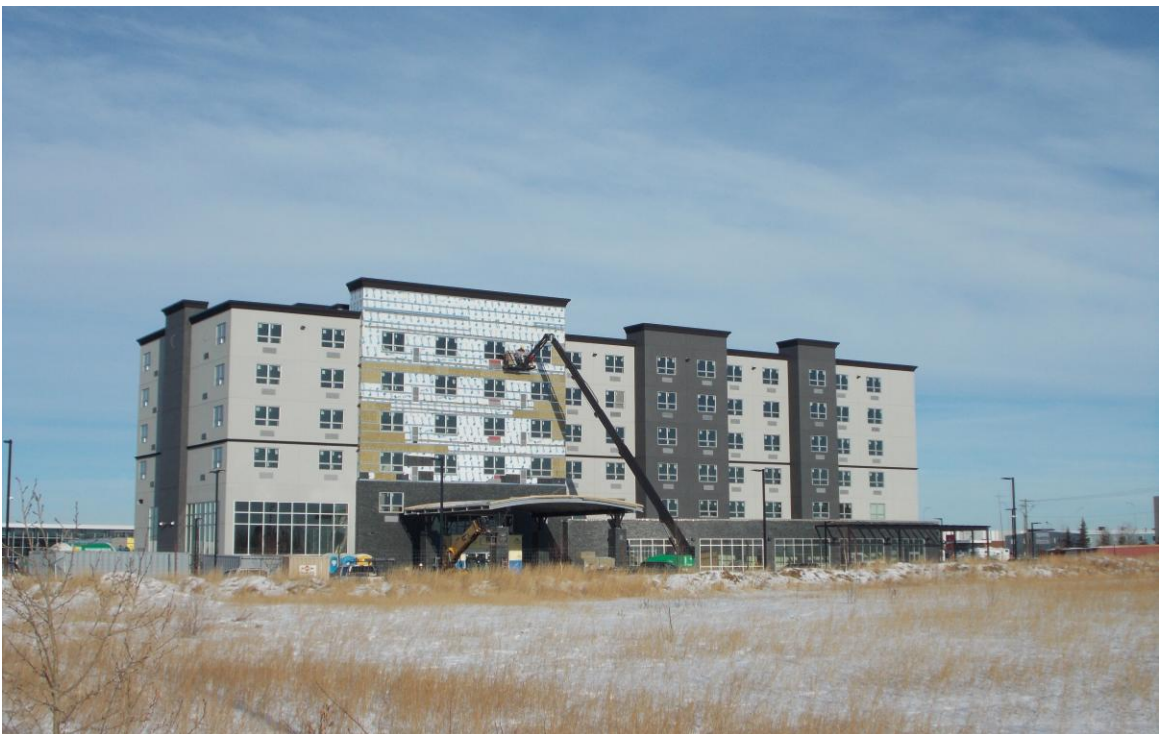
Holiday Inn, 20 Freeport Crescent NE, Calgary