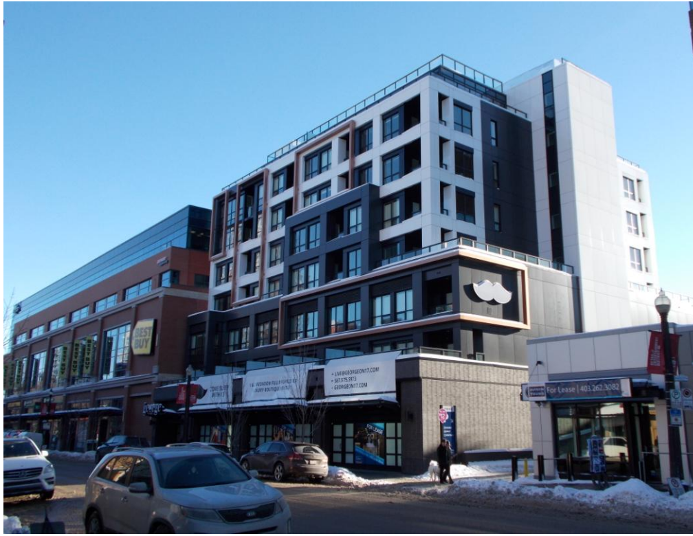
Truman Condominium, 17 th Ave SW, Calgary