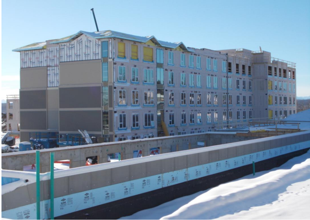
Horizon Housing Condominium Development, SW Calgary