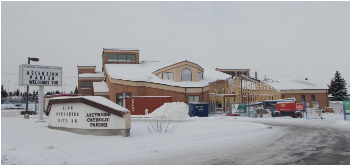
Ascension Catholic Parish, Calgary