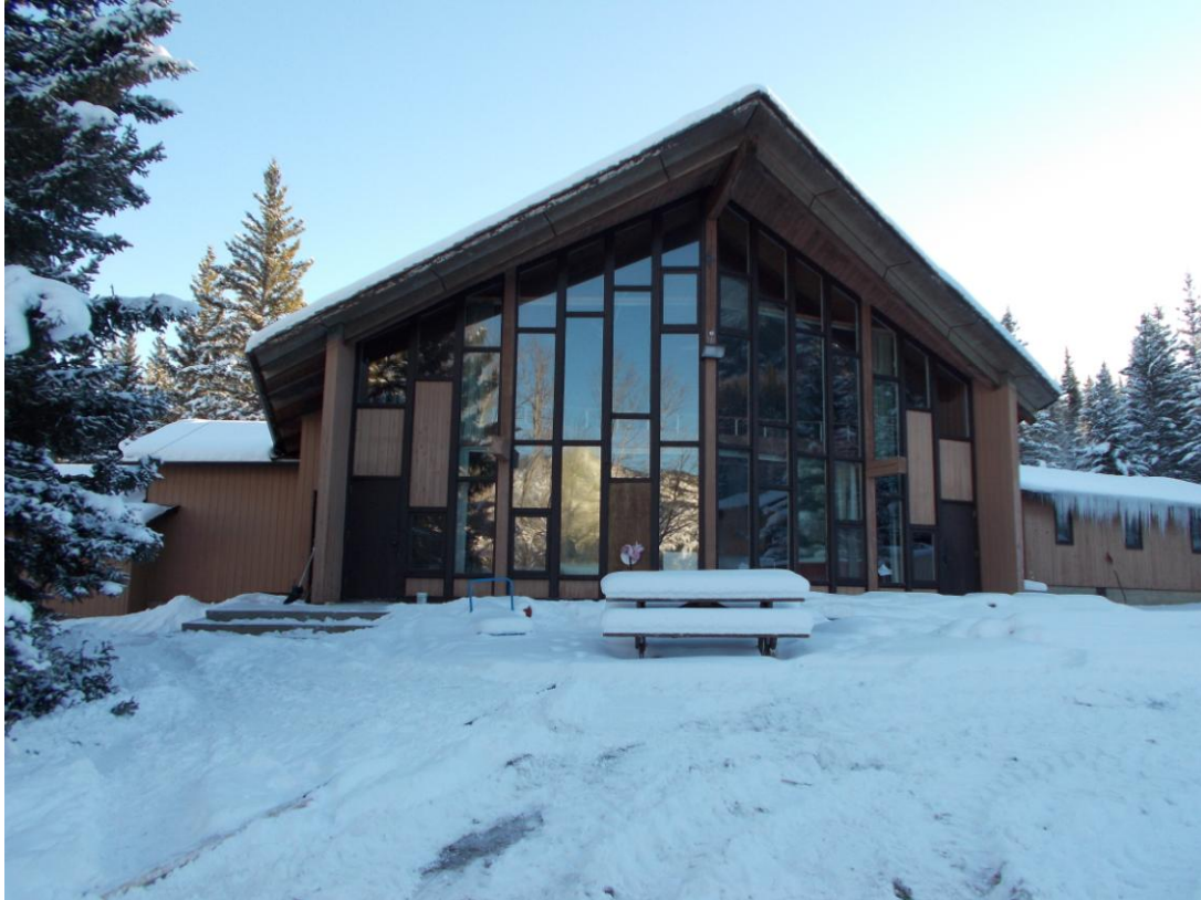
University of Calgary, Barrier Lake Research Centre