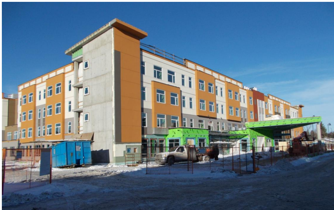
Riverview Long Term Care Centre, Southeast Calgary