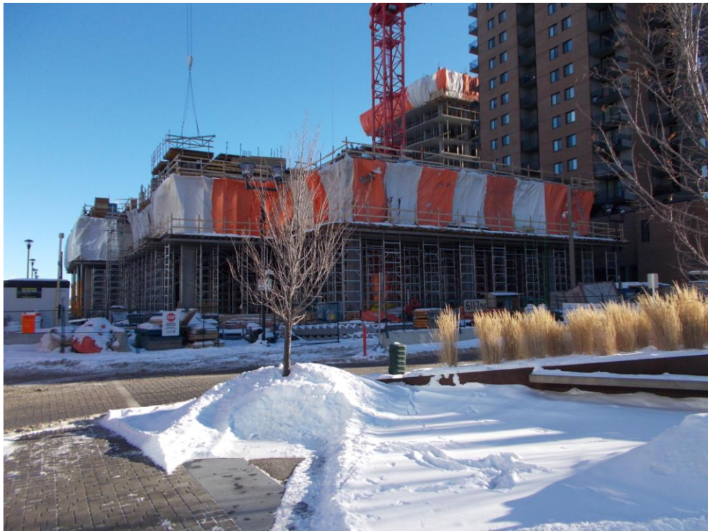
East Village High Rise Condominium Development with Underground Parkade