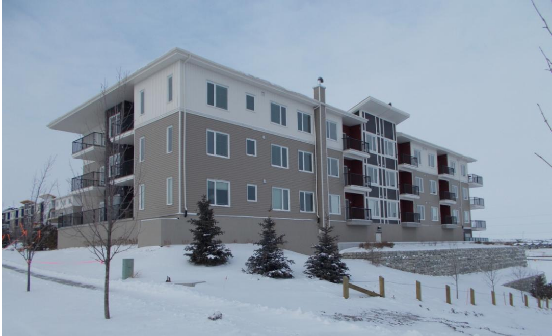
Beacon Heights Condominium Development, Calgary