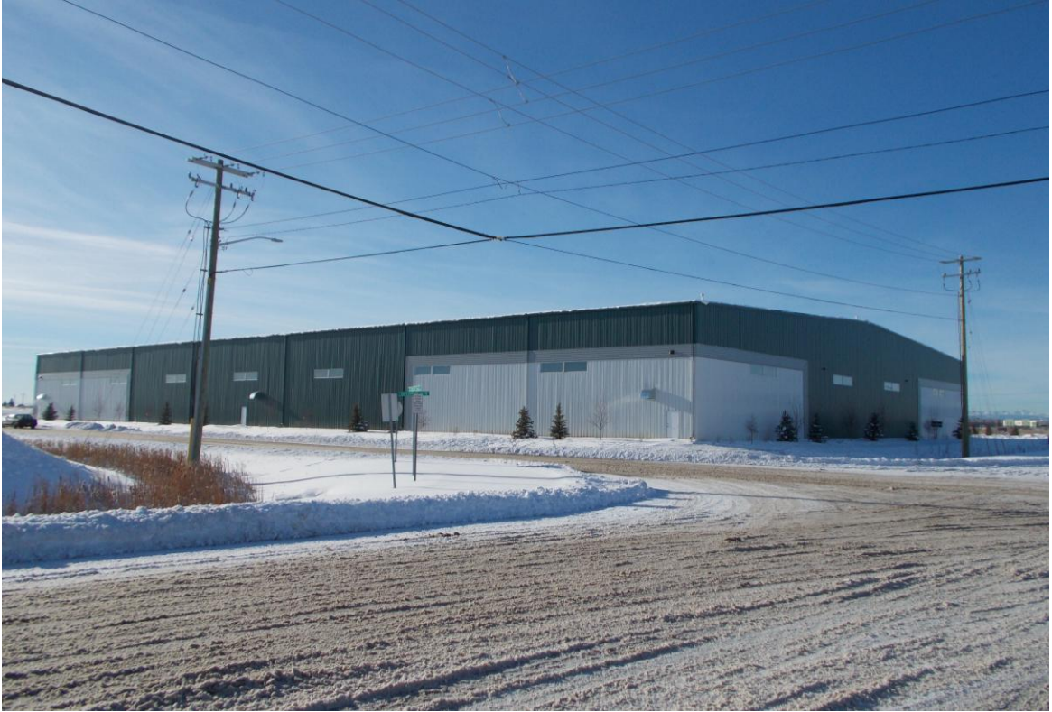
Foothills Soccer Centre, Southeast Calgary