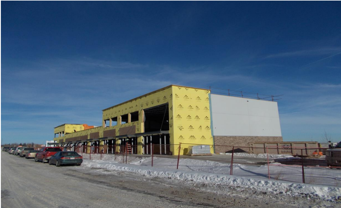
Highview Place, 8400 Blackfoot Trail SE, Calgary