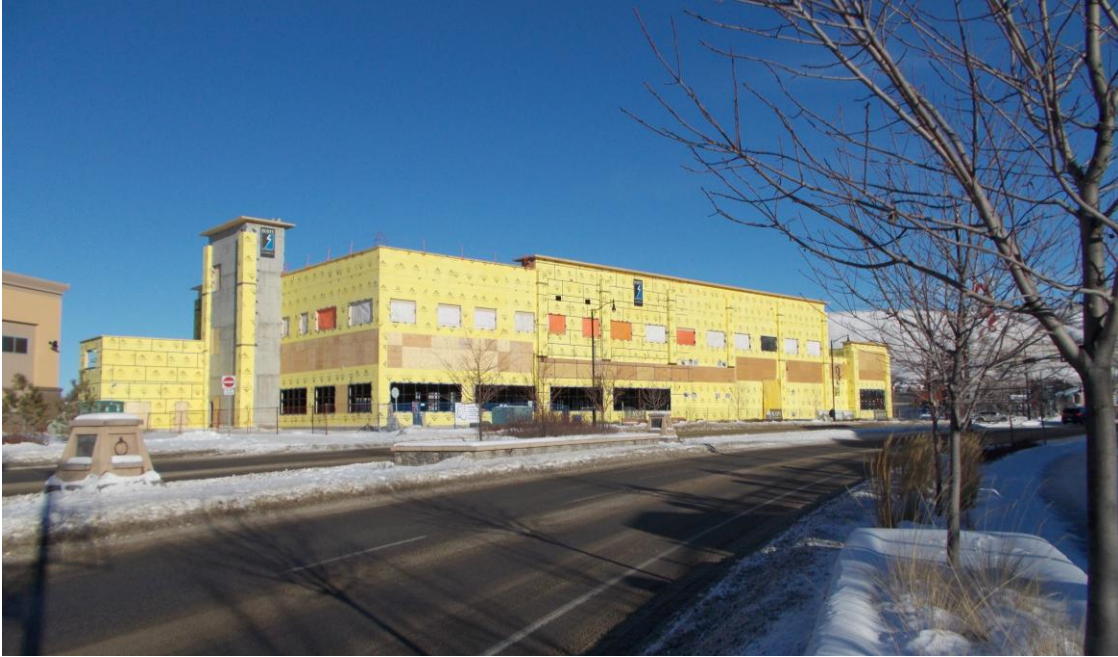
Springwood Commercial Development, Cochrane