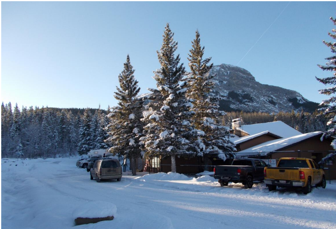
University of Calgary, Barrier Lake Research Centre