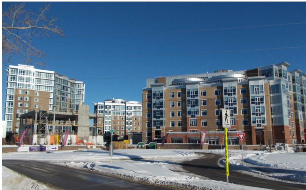
Groves of Varsity Condominiums, High Rise Buildings with Underground Parkade, Northwest Calgary