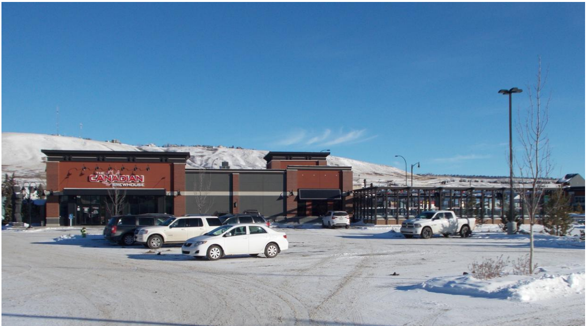
Canadian Brewhouse for Springwood Commercial Development, Cochrane