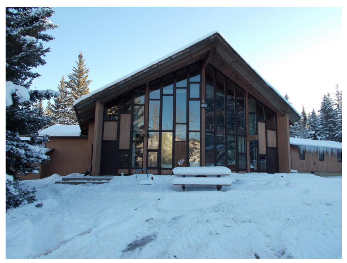
University of Calgary, Barrier Lake Research Centre