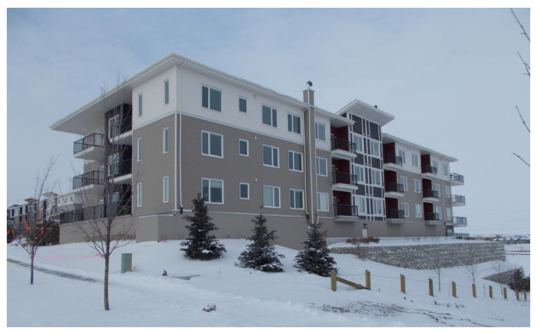
Beacon Heights Condominium Development, Calgary