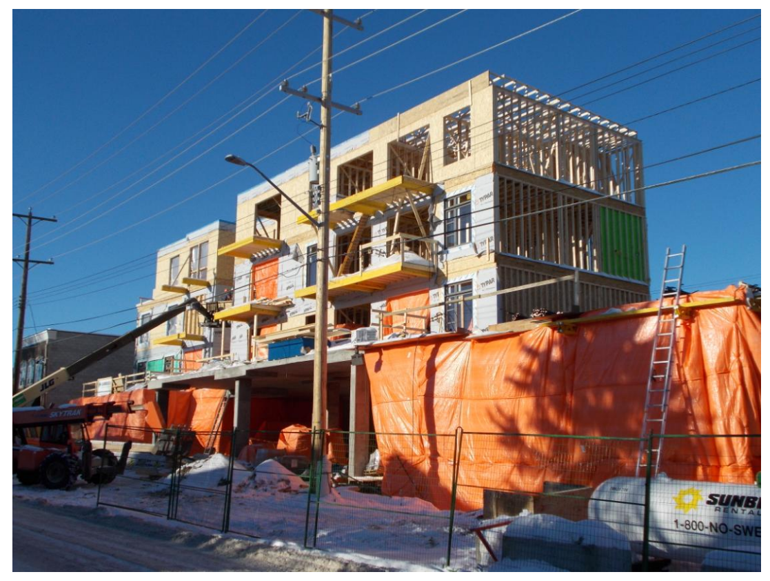
Infinity Condominium Development, Marda Loop, Calgary