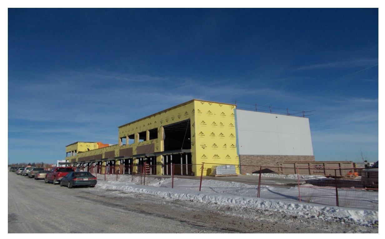
Highview Place, 8400 Blackfoot Trail SE, Calgary