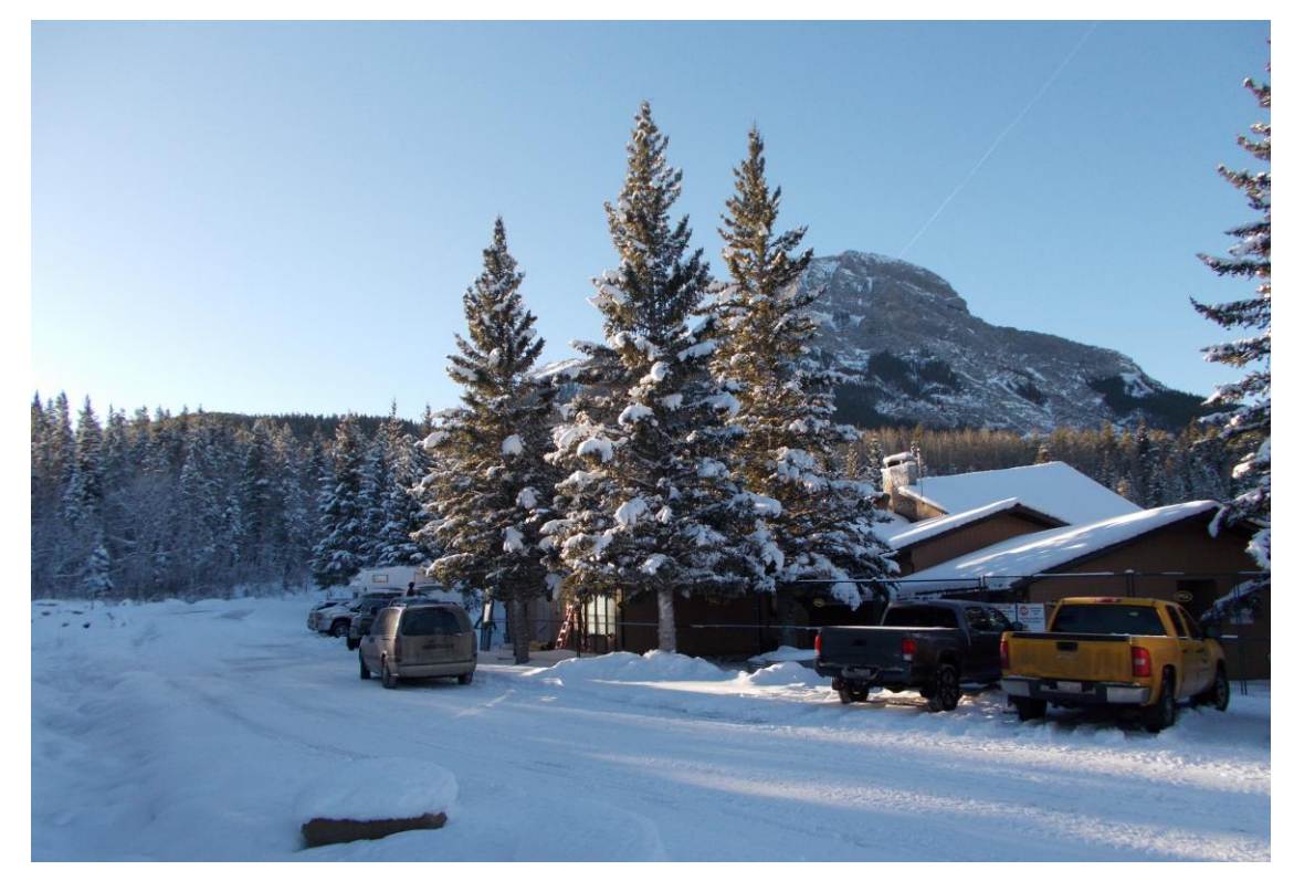
University of Calgary, Barrier Lake Research Centre