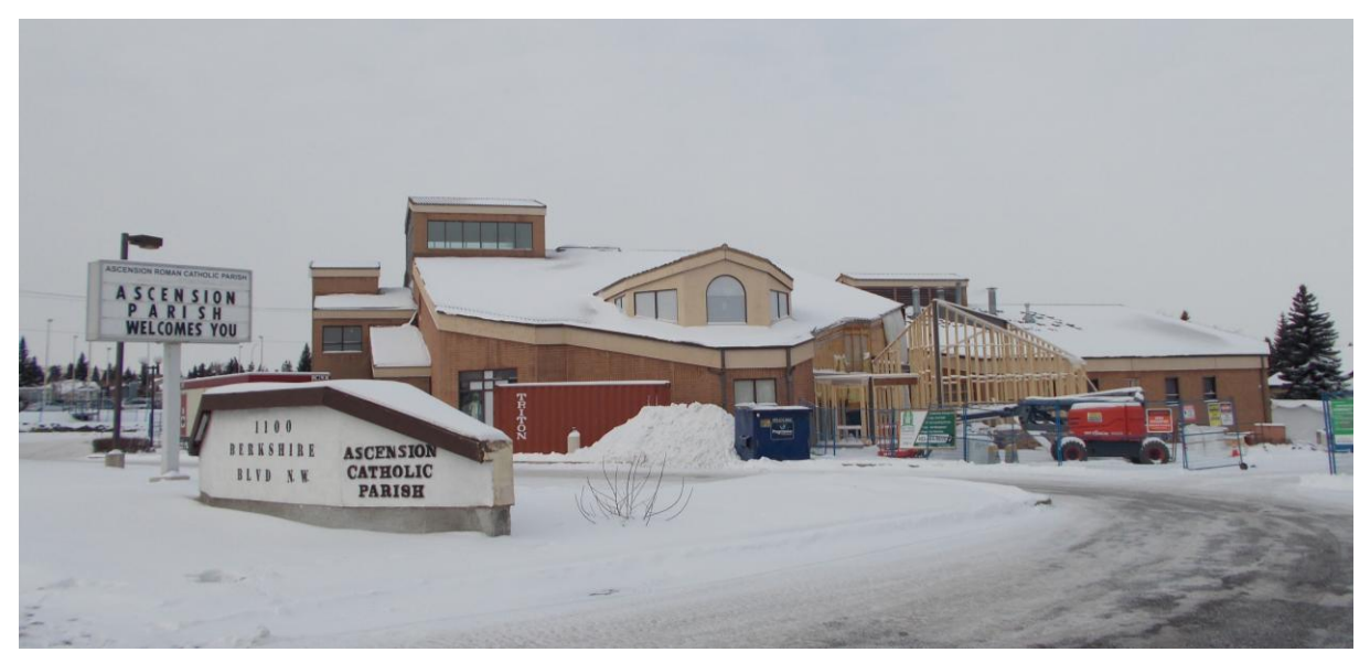
Ascension Catholic Parish, Calgary