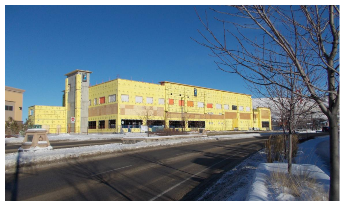
Springwood Commercial Development, Cochrane