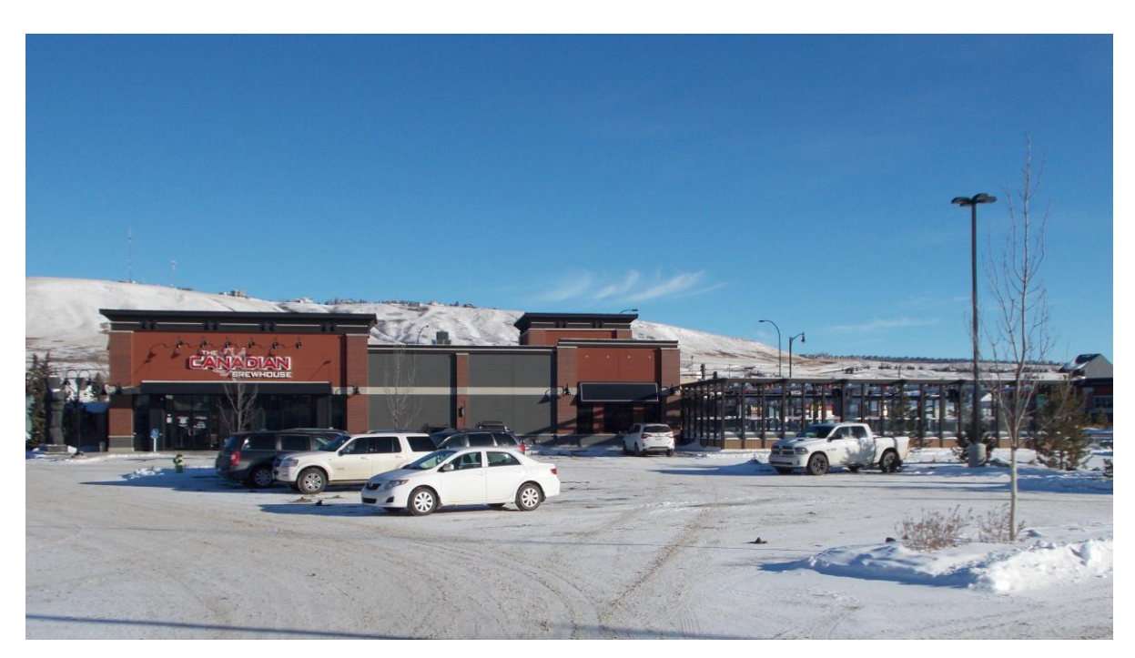
Canadian Brewhouse for Springwood Commercial Development, Cochrane