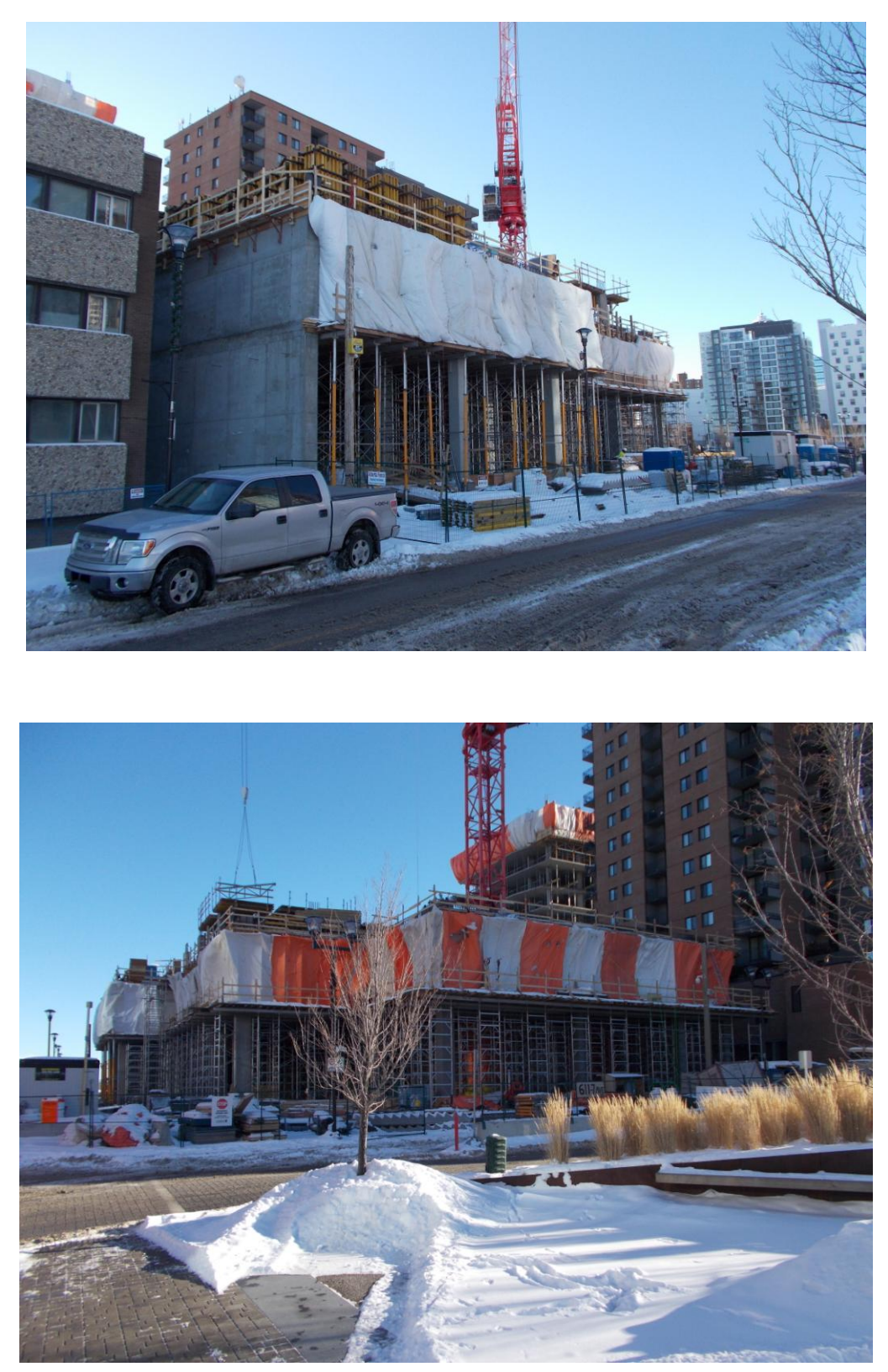
East Village High Rise Condominium Development with Underground Parkade