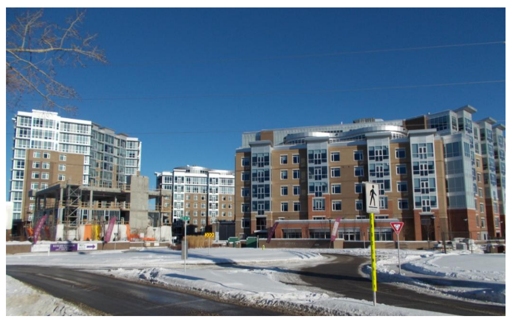
Groves of Varsity Condominiums, High Rise Buildings with Underground Parkade, Northwest Calgary