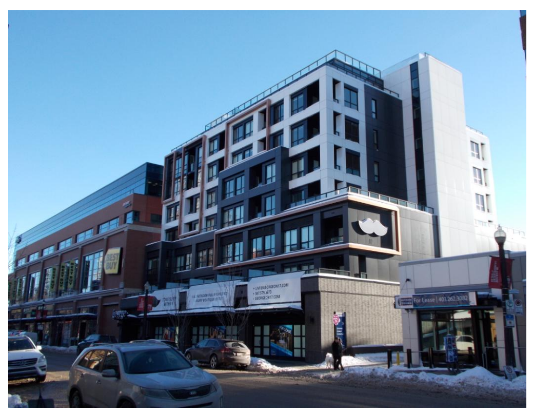
Truman Condominium, 17<sup>th</sup> Ave SW, Calgary