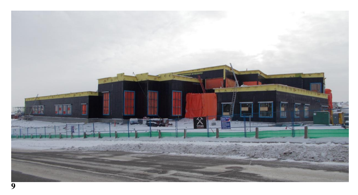
Sherwood K – 9 Catholic School, Calgary