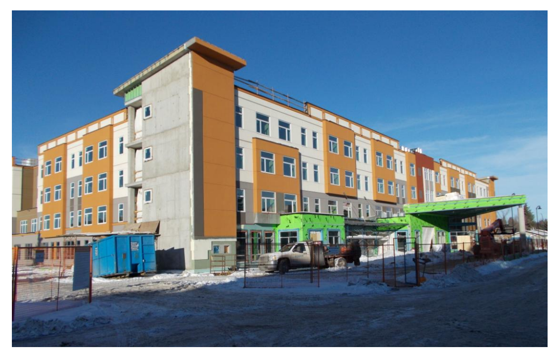
Riverview Long Term Care Centre, Southeast Calgary