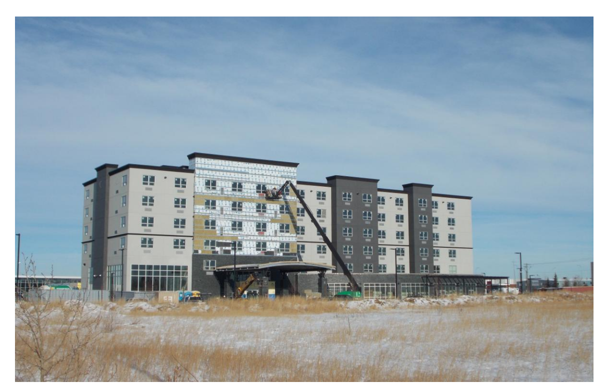
Holiday Inn, 20 Freeport Crescent NE, Calgary