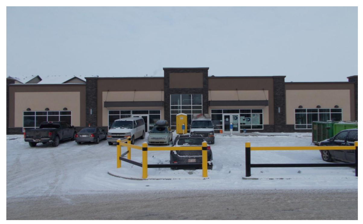
Panorama Calgary Co-op Commercial Building, Calgary