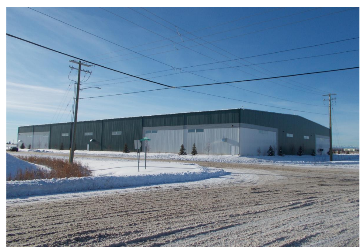
Foothills Soccer Centre, Southeast Calgary